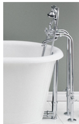
#3970 Heavy Duty Water Supply Lines