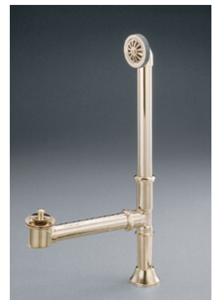
#2222 Waste & Overflow