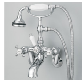
#5100 Tub Filler with Hand Shower