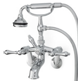
#5115LEV Tub Filler with Hand Shower