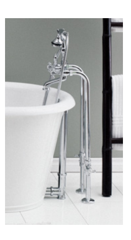
#3970 Heavy Duty Water Supply Lines