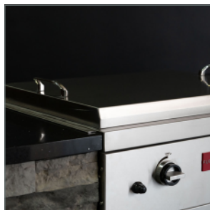
Griddle Top Cover