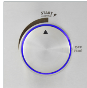
LED Backlit Knobs