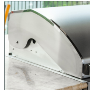
Easy Mount Side Brackets