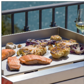
Meat, Veggies & More