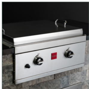
Sleek Front Panel Design