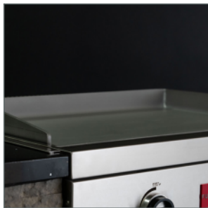
Heavy Duty 8mm Griddle