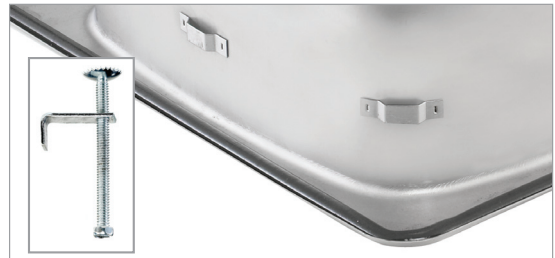
Inset: Hold down

Off-the-Bowl clips for ease of installation.