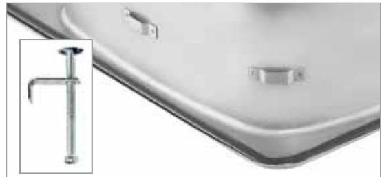
Inset: Hold down

Off-the-Bowl clips for ease of installation.