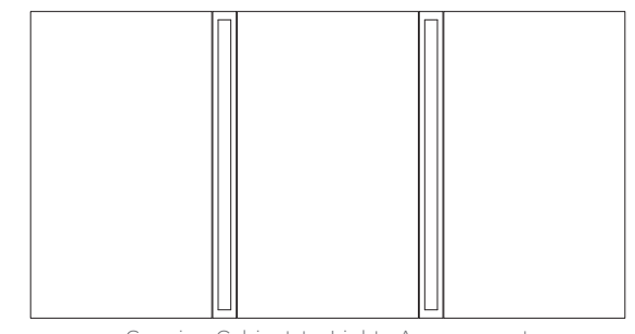
Ganging Cabinet-to-Lights Arrangement