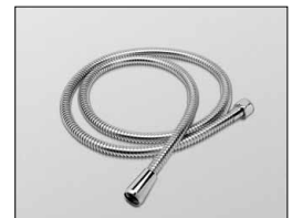
TS101W60 Shower Hose 60"