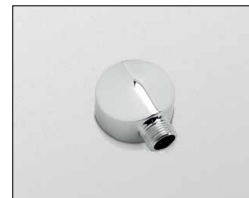
TS101R Wall Outlet

Please note the following components are sold separately: