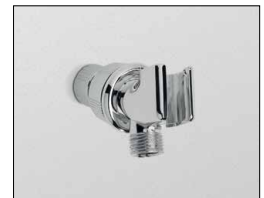
TS101S Shower Arm Mount