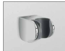
TS101V Handshower Wall-Mount