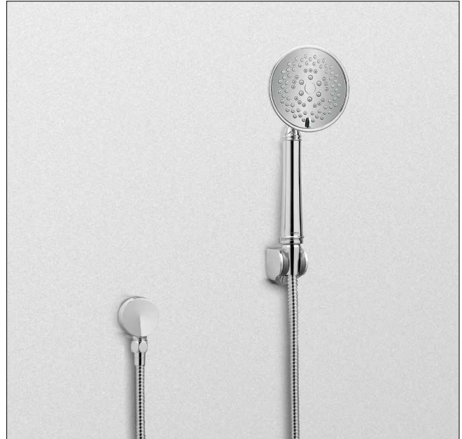
TS300FL55: Traditional Collection Series A Multi-Spray Handshower 4-1/2"

The multi-spray handshower shall have a maximum flow rate of 2.0 gpm (7.6 lpm). Product shall have a 4-1/2" handshower and a 4" diameter spray face. Product shall have 5 multifunction spray modes. Spray modes shall be spray, spray and massage combo, massage, mist and pause. Product shall have rubber nozzles to prevent limescale build up. Product shall be TOTO Model TS300FL55#_____.