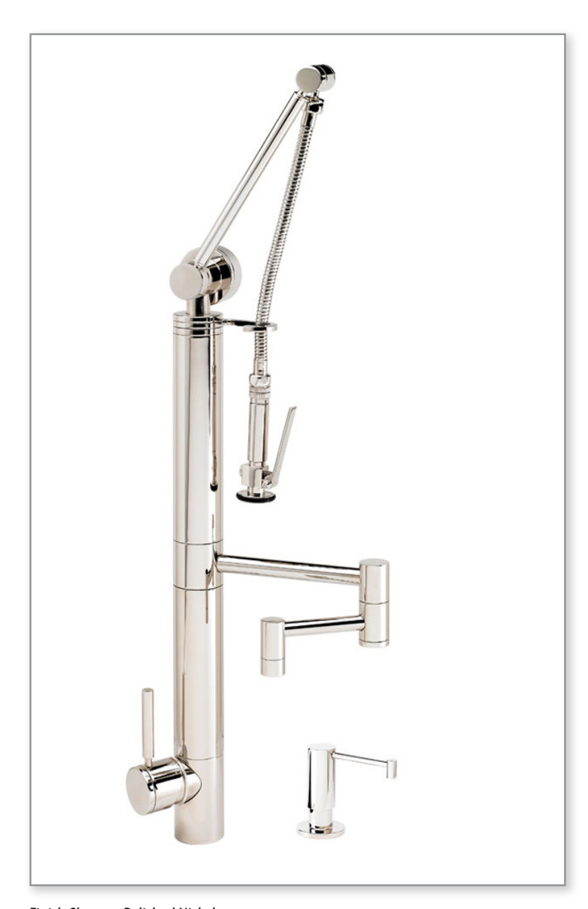
Finish Shown - Polished Nickel