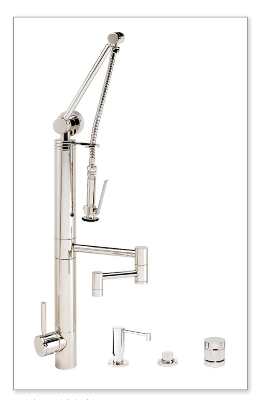
Finish Shown - Polished Nickel