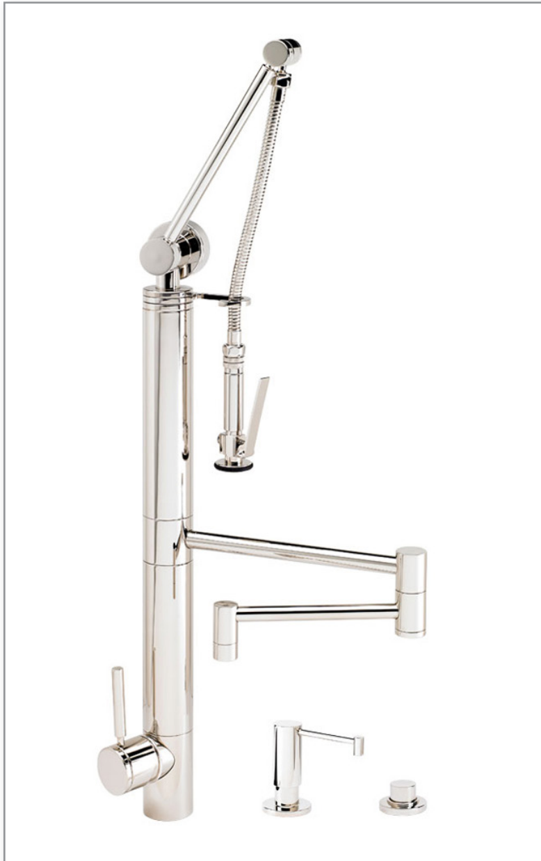
Finish Shown - Polished Nickel