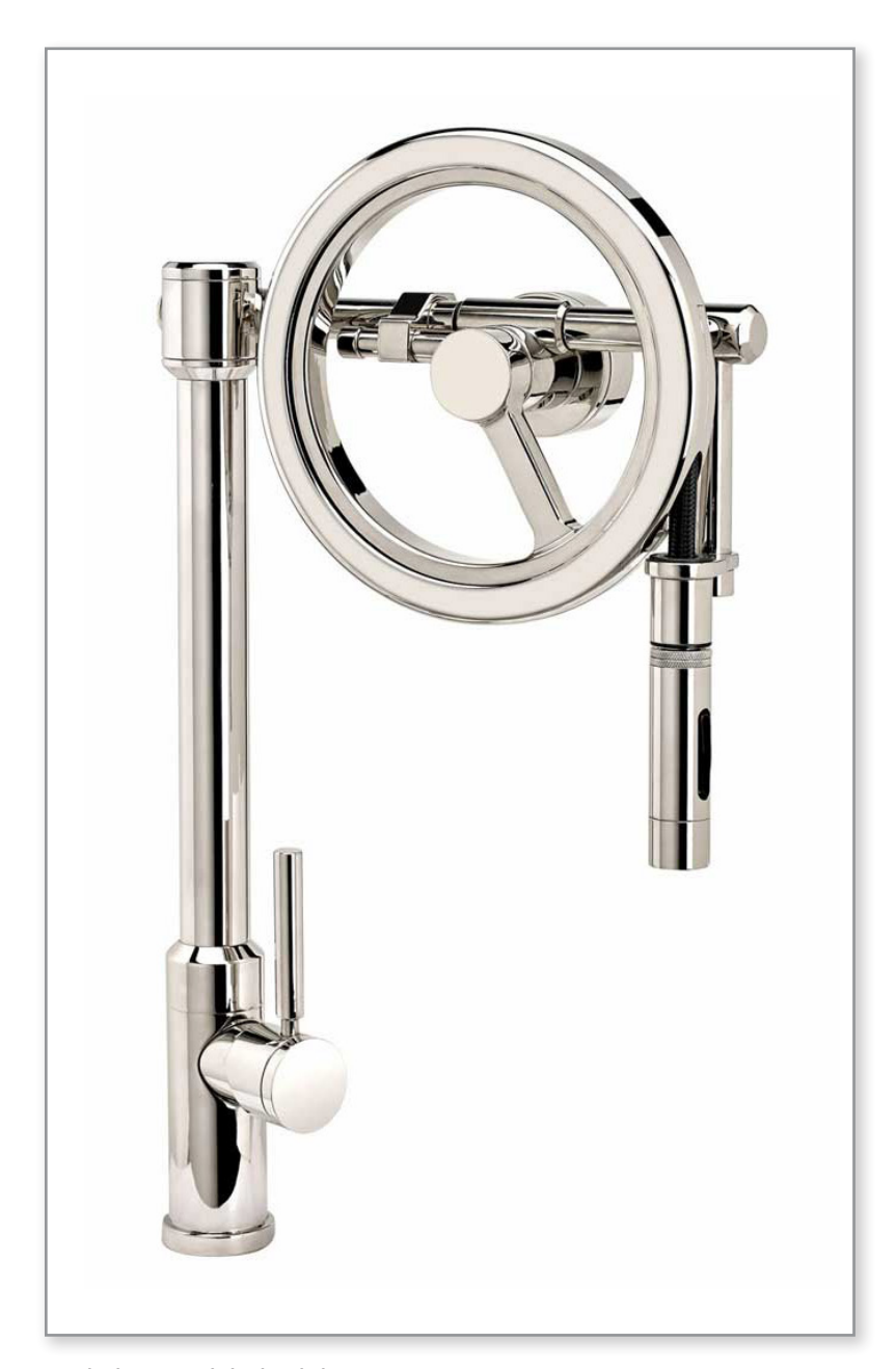
Finish Shown - Polished Nickel