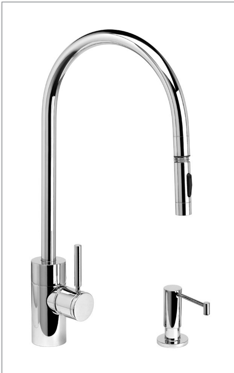
Finish Shown - Chrome