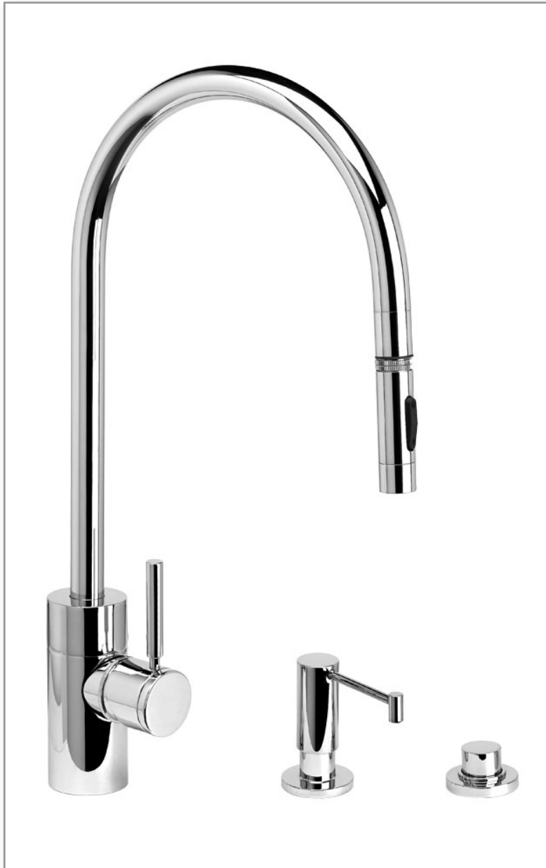
Finish Shown - Chrome