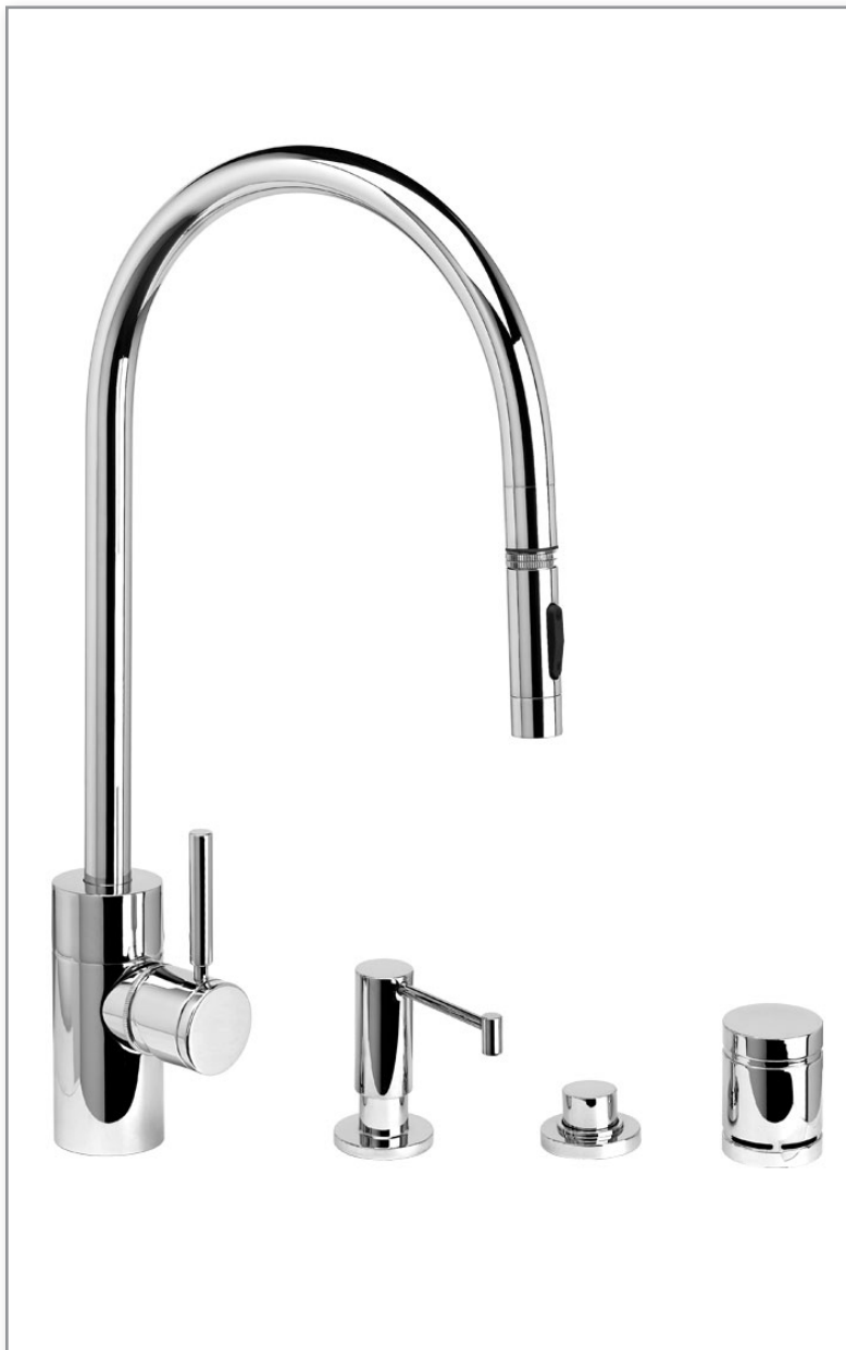
Finish Shown - Chrome