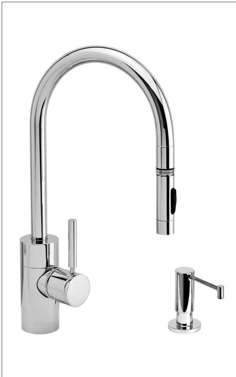
Finish Shown - Chrome