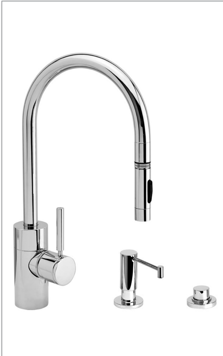
Finish Shown - Chrome