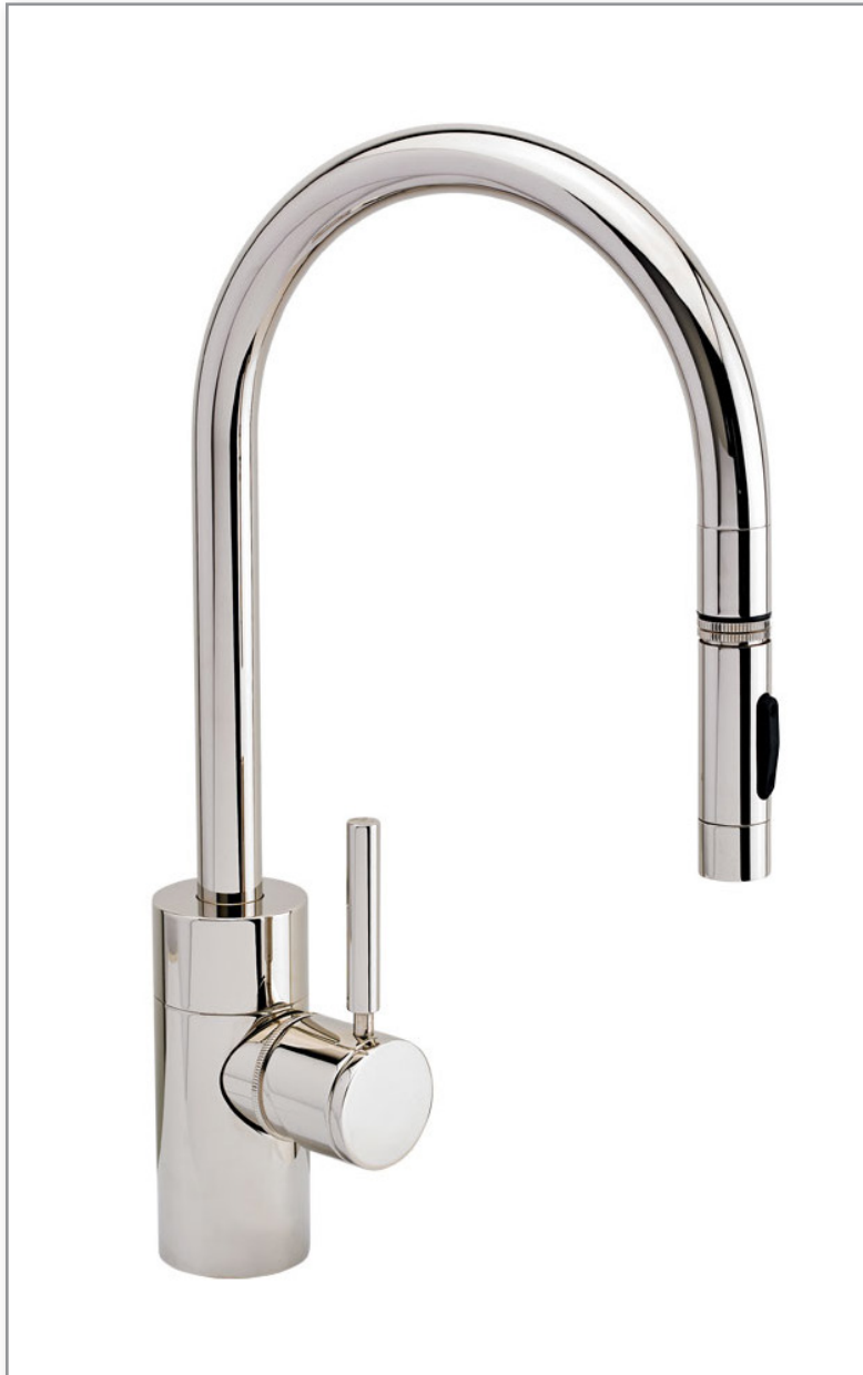
Finish Shown - Polished Nickel