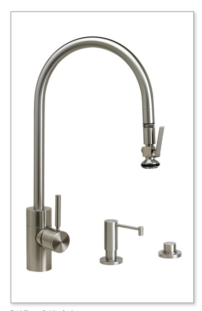
Finish Shown - Stainless Steel