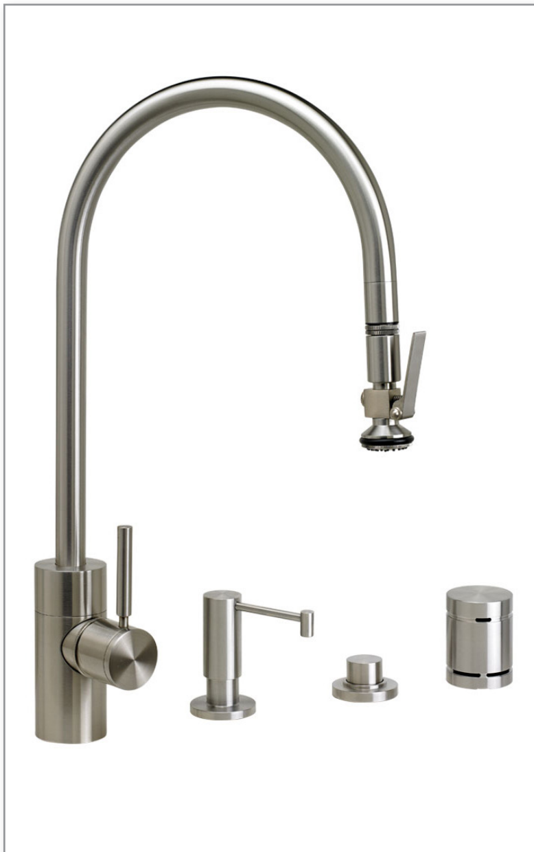
Finish Shown - Stainless Steel