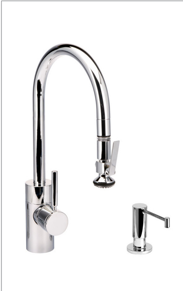
Finish Shown - Chrome