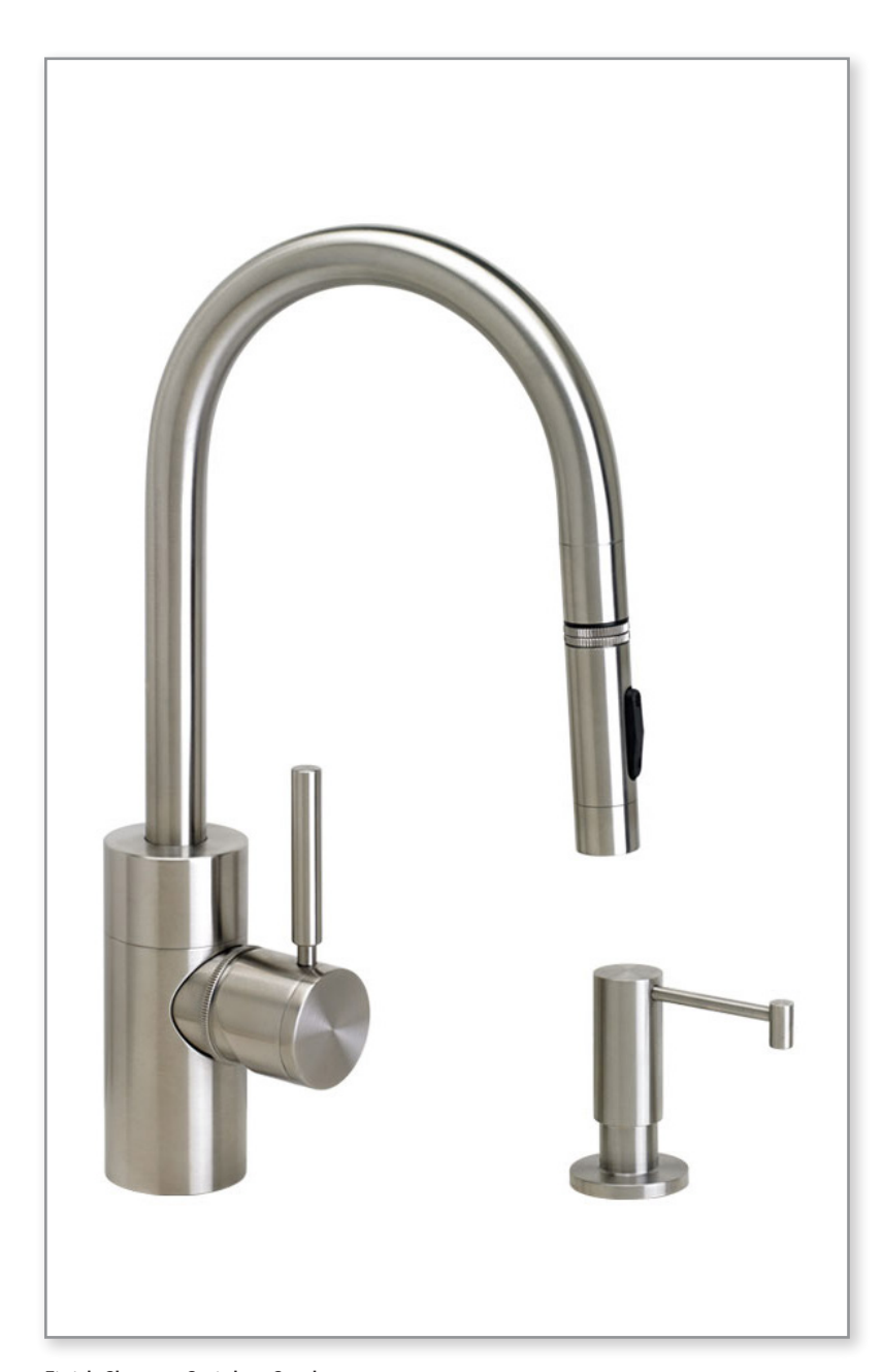
Finish Shown - Stainless Steel