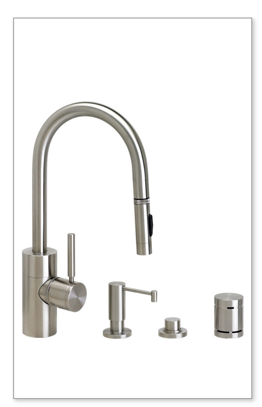
Finish Shown - Stainless Steel