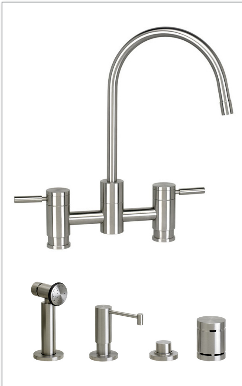
Finish Shown - Stainless Steel