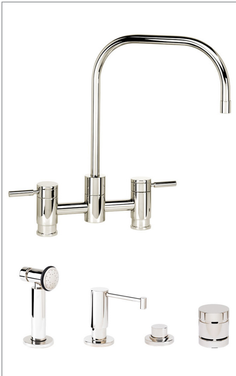
Finish Shown - Polished Nickel