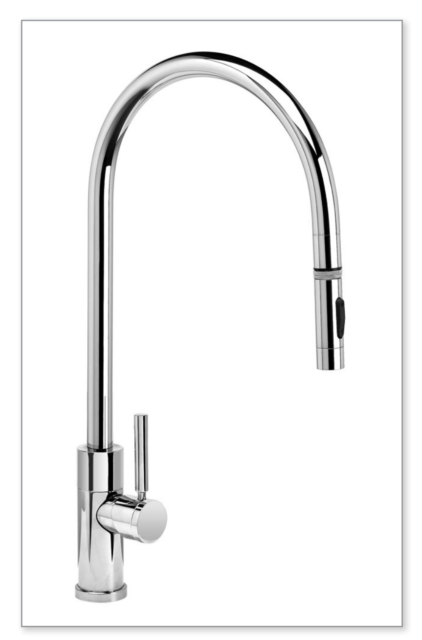
Finish Shown - Chrome