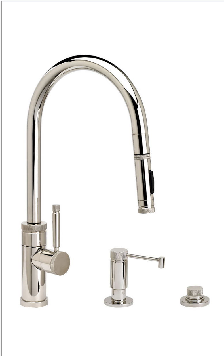
Finish Shown - Polished Nickel