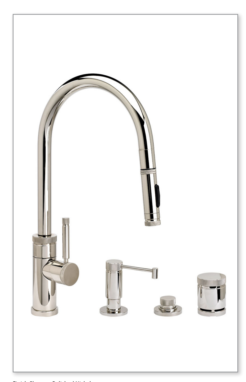
Finish Shown - Polished Nickel