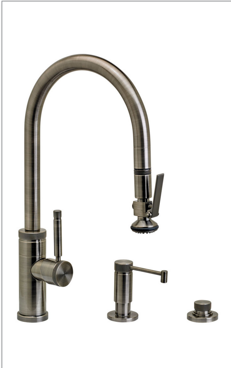
Finish Shown - Antique Pewter