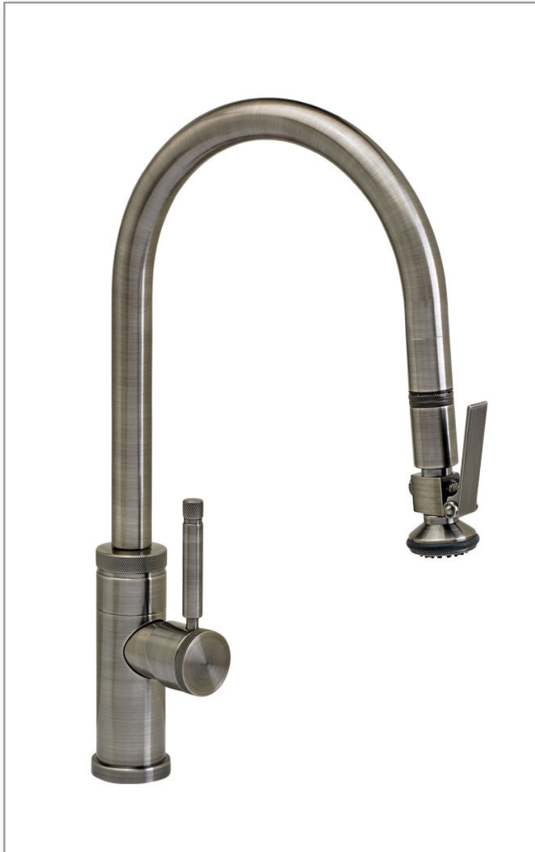
Finish Shown - Antique Pewter