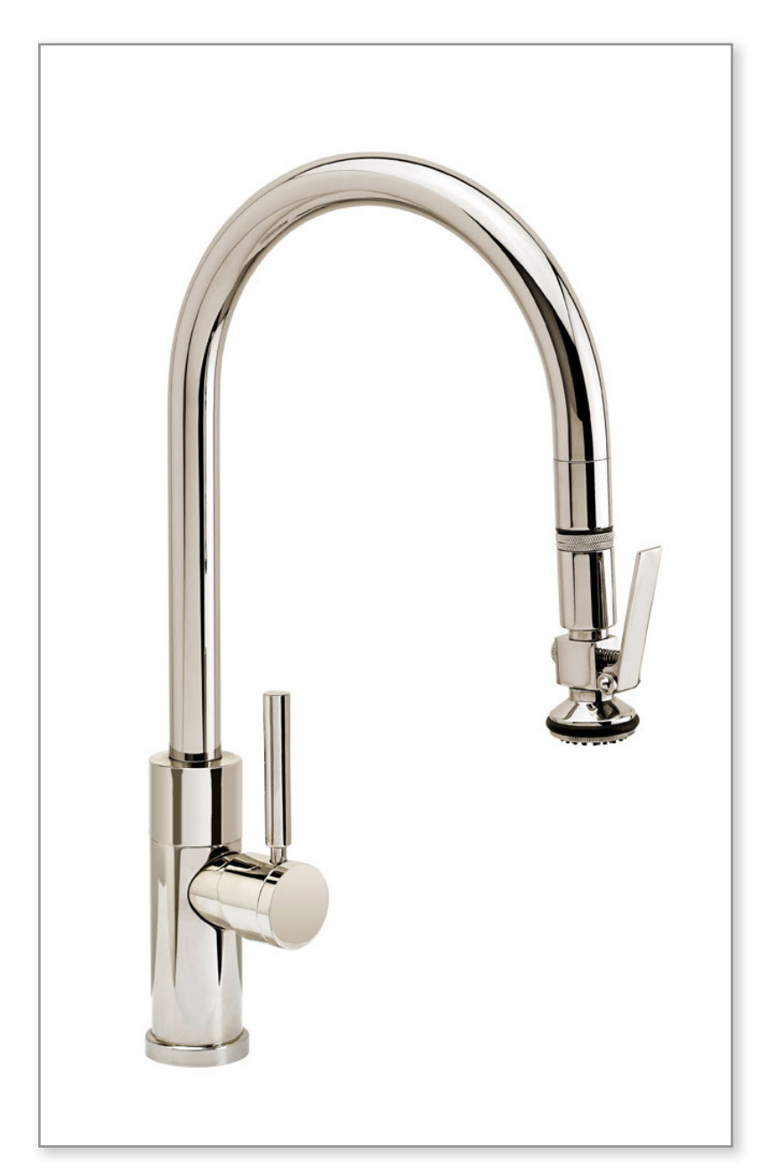
Finish Shown - Polished Nickel