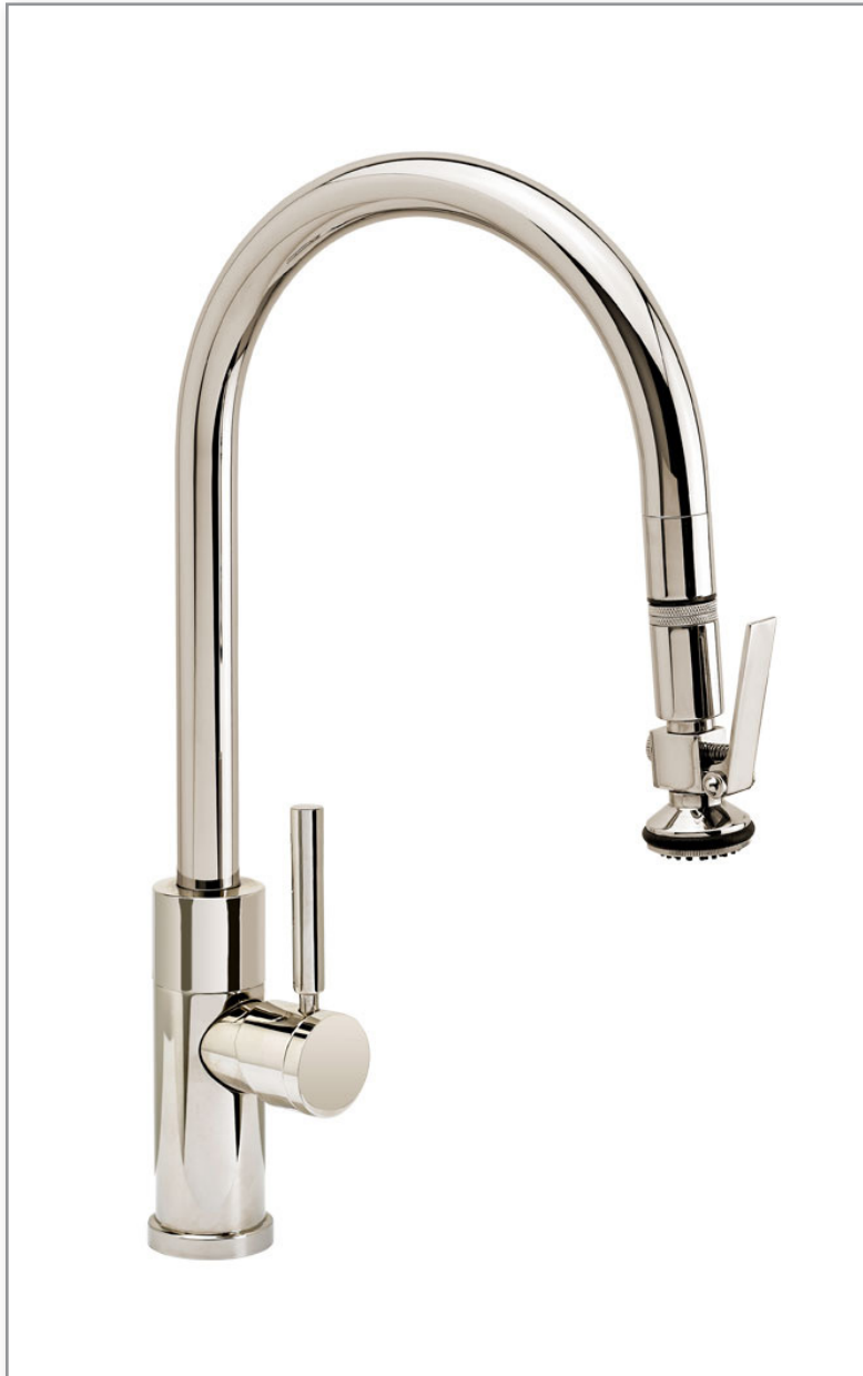
Finish Shown - Polished Nickel