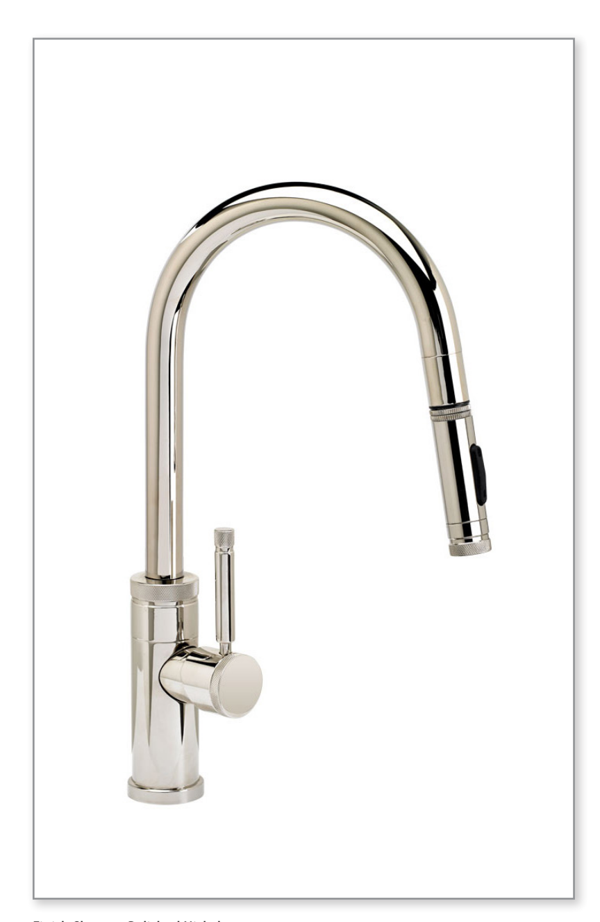
Finish Shown - Polished Nickel