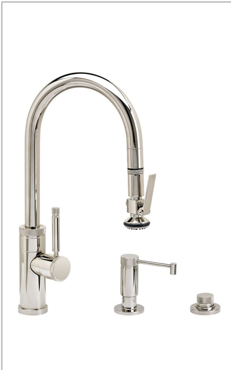
Finish Shown - Polished Nickel