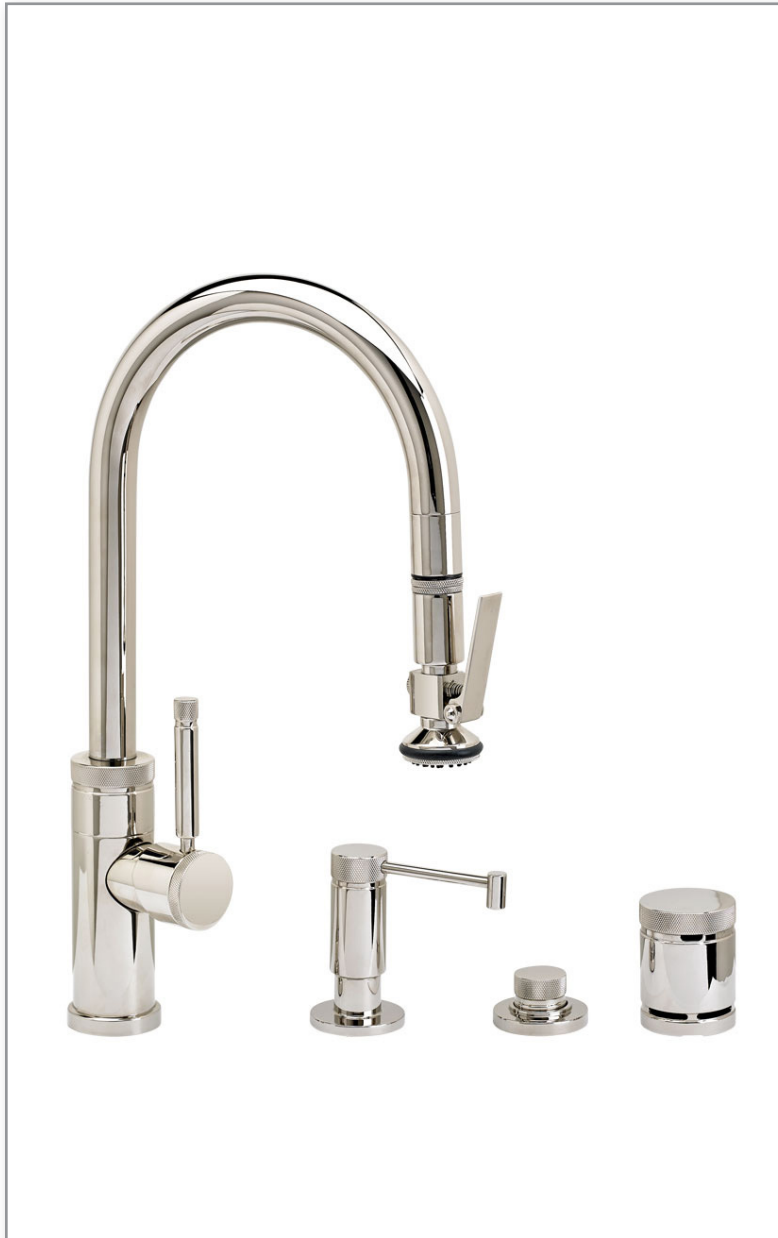
Finish Shown - Polished Nickel