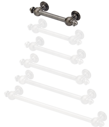
Finish Shown - Antique Pewter