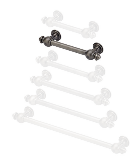
Finish Shown - Antique Pewter

DIMENSIONS MAY VARY AND ARE SUBJECT TO CHANGE. NO RESPONSIBILITY IS ASSUMED FOR USE OF SUPERCEDED OR VOIDED DATA