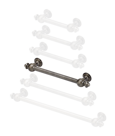
Finish Shown - Antique Pewter

DIMENSIONS MAY VARY AND ARE SUBJECT TO CHANGE. NO RESPONSIBILITY IS ASSUMED FOR USE OF SUPERCEDED OR VOIDED DATA