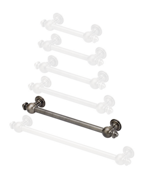
Finish Shown - Antique Pewter

DIMENSIONS MAY VARY AND ARE SUBJECT TO CHANGE. NO RESPONSIBILITY IS ASSUMED FOR USE OF SUPERCEDED OR VOIDED DATA