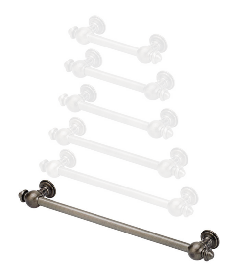
Finish Shown - Antique Pewter

DIMENSIONS MAY VARY AND ARE SUBJECT TO CHANGE. NO RESPONSIBILITY IS ASSUMED FOR USE OF SUPERCEDED OR VOIDED DATA